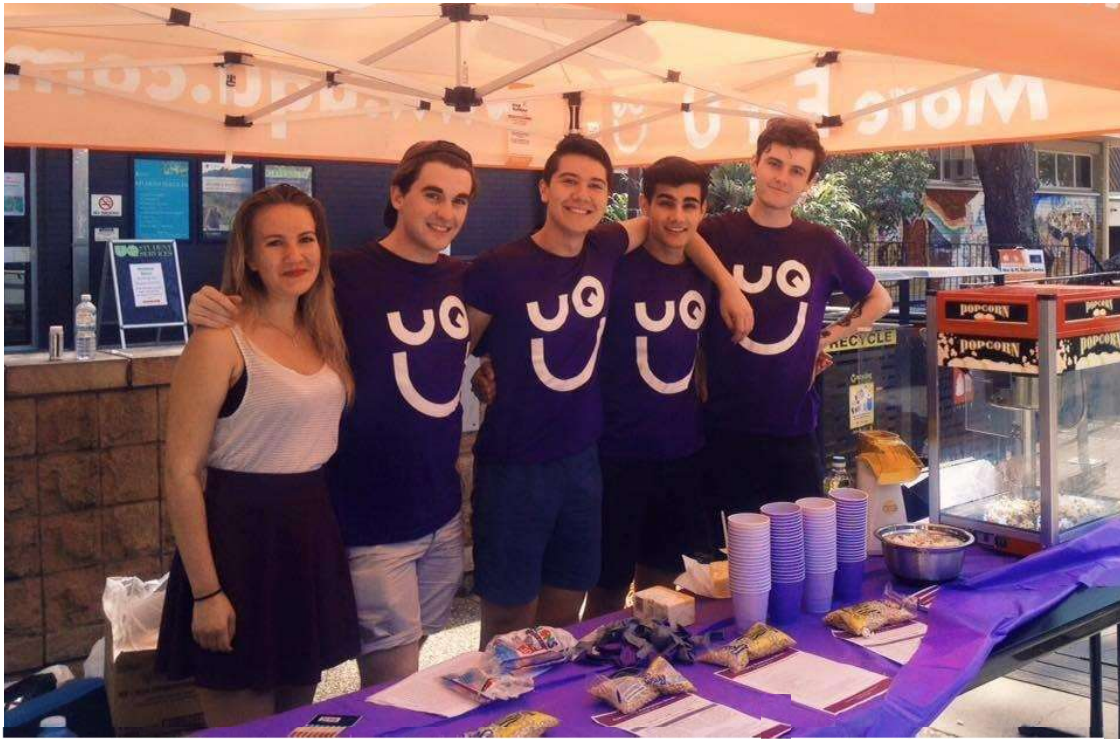
UQ PALs hosting an Asexuality Awareness Week stall

The UQ Pride Alliance, affectionately known as PALS, is a new club at UQ for queer students. The club has three main aims and throughout the year we'll be holding events from parties to awareness stalls to help queer students on campus.